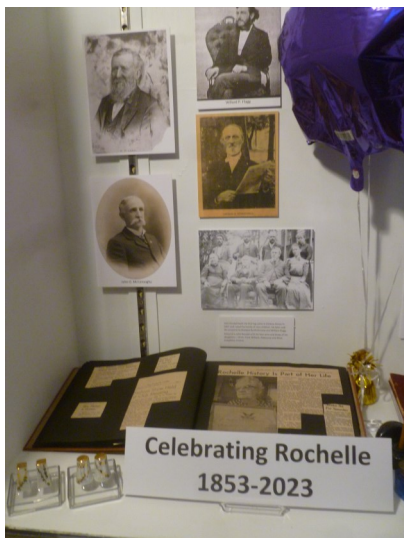
In the Cabinet of Curiosities 2023