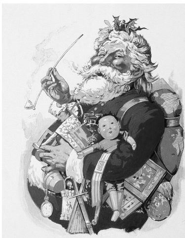
Thomas Nast's iconic image of Santa Clause of 1881 was inspired by C. Clement Moore's poem, A Visit From St. Nicholas .

No matter how "Santa" traveled to you this past year, we hope you didn't get the gift of coal!