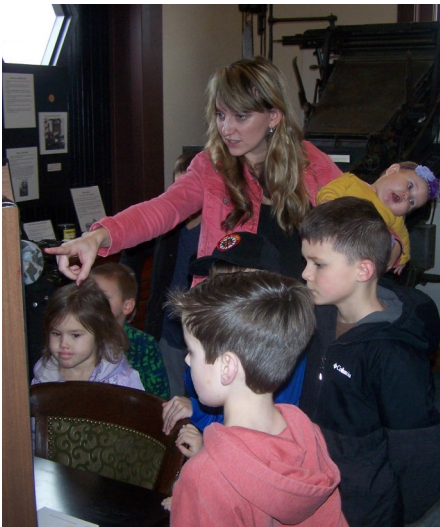
Homeschool Group 2023

... acquisition is defined as the discovery, preliminary evaluation, taking physical and legal custody of, and acknowledging receipt of materials and objects.