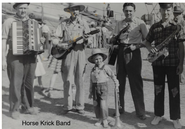
Horse Krick Band

One band that we don't know anything about is the Horse Krick Band. Anyone have any information about this band?