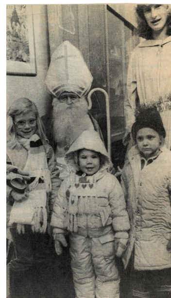
An early Santa at the Museum Date unknown

From 2 to 3 pm Santa will be available via ZOOM to chat with you electronically. Watch for the link or call the museum in December.